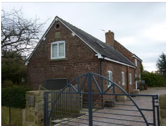
Sensitively-designed modern gates at Wigsey Cruck