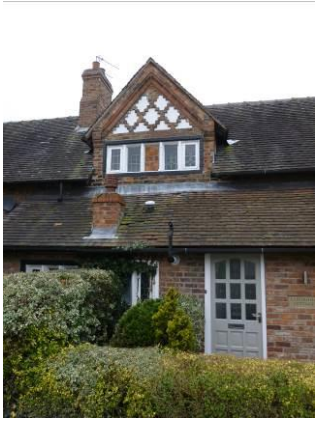
A large first floor dormer window with small lights