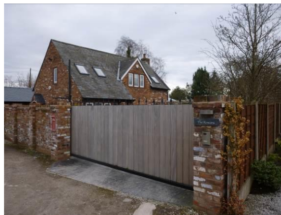
Inappropriate gates at The Rowans, Church Green