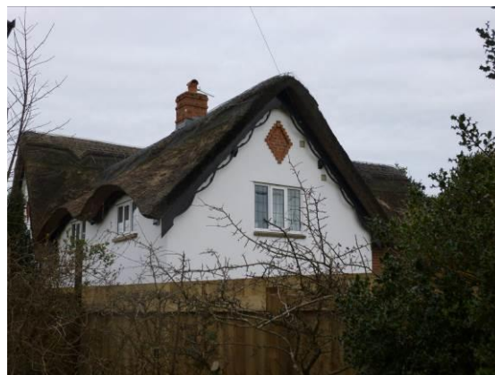
Replacement uPVC windows at 1 Wigsey Lane