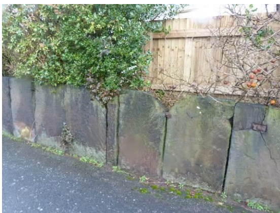
Characteristic flagstone wall with supplementary planting. Extra planting is preferable over the timber panelled fence. Also note the damage to the flagstones where the ties have been inserted.