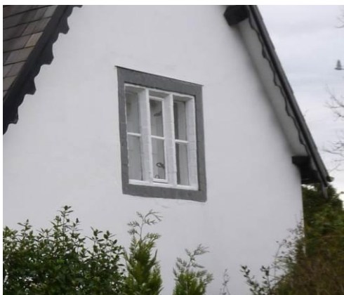
Historic casement windows