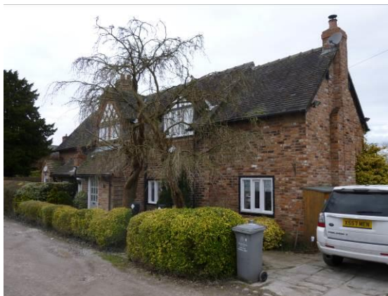
Well-maintained border planting on Church Green