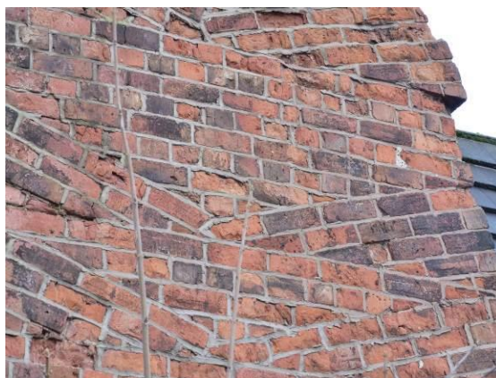
Damaged brickwork on the toll cottage due to inappropriate mortar repairs

ensure the longevity of the bricks, a traditional lime mortar should be used for the pointing rather than a cementitious mix, which can cause spalling and other damage. This is evident on the chimney stack of the toll cottage.