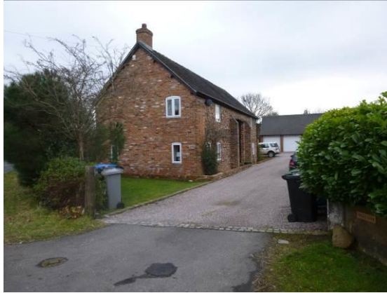
The Barn, Wigsey Farm. Note the very simple detailing and the wide opening between the two buttresses (slightly obscured by the restricted angle of the photograph taken from the public highway)