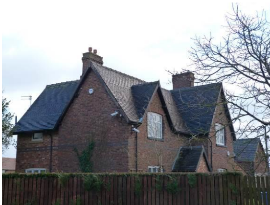
Townfield House, with a decorative diamond pattern in the roof tiles